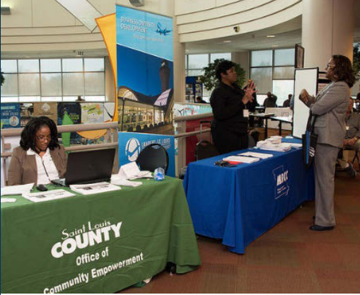
Vendors at the symposium.