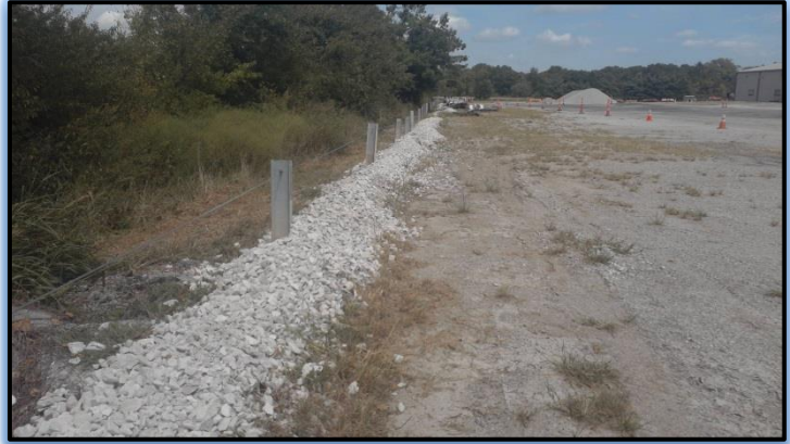
Figure 3: Maintenance facility in SW District.

The FRCP is kept on MoDOT's SharePoint site and at the facility location along with the SPCC plan.