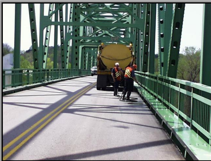
Figure 2: Street sweeping and bridge washing.

All state and federal requirements are met when accomplishing this task ( EPG: 771.2 Bridge Cleaning and Flushing ) (Appendix G).