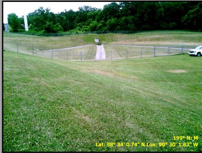
Figure 1: Permanent detention basin on Route 141 and Big Bend Rd.

The intent of this MCM is to develop, implement and enforce a program to reduce pollutants and reduce water quality impacts from site improvements on MoDOT's system.