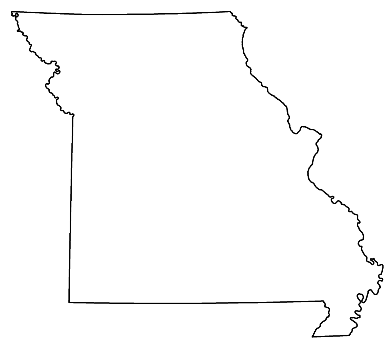
MoDOT's Statewide Projects