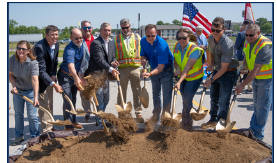
Members of the Millstone Weber and Jacobs Inc. teams at the June 13 groundbreaking of Project #1.

The Design-Build contractor team currently has numerous engineers working to finalize design plans and is anticipating over 300 field employees and that nearly a million man hours will be worked over the course of this first project. The people involved in this project are experts in their field with vast levels of experience. In a full circle moment, some of these experts began their careers at MoDOT.