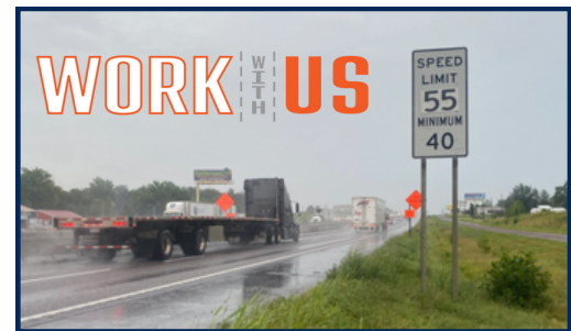
The speed limit has been reduced to 55 miles per hour along I-70 between Callaway County Routes J and M.

As construction continues, MoDOT wants to remind travelers to Work With Us by making safe, responsible choices behind the wheel and slowing down when driving through work zones. It's not just a courtesy to slow down and move over for these work zones—it's the law. Even when workers are behind barrier wall, the work zone speed limit is reduced because the driver lanes are narrowed and traffic has to drive next to the wall. Drivers should be aware of changing traffic conditions, observe warning signs and merge before reaching lane closures. MoDOT wants every driver to make it to their destination safely and for all workers to go home safe after each shift.