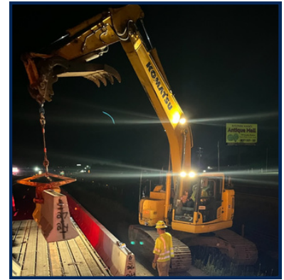
Crews have been working overnight to install temporary barrier walls along both directions of I-70 between Callaway County Routes J and M.

By mid-September, the first concrete pavement will be placed on the base. Currently, the plan is to pave the seven-mile stretch of eastbound I-70 between Callaway County Routes J and M and then pave westbound I-70 for the new inside lane and shoulder. It is expected to take around two months to pave both directions of this first segment.