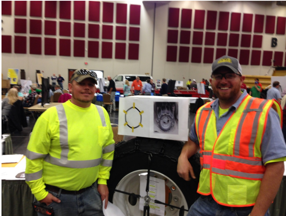
Tire Chain Tensioner