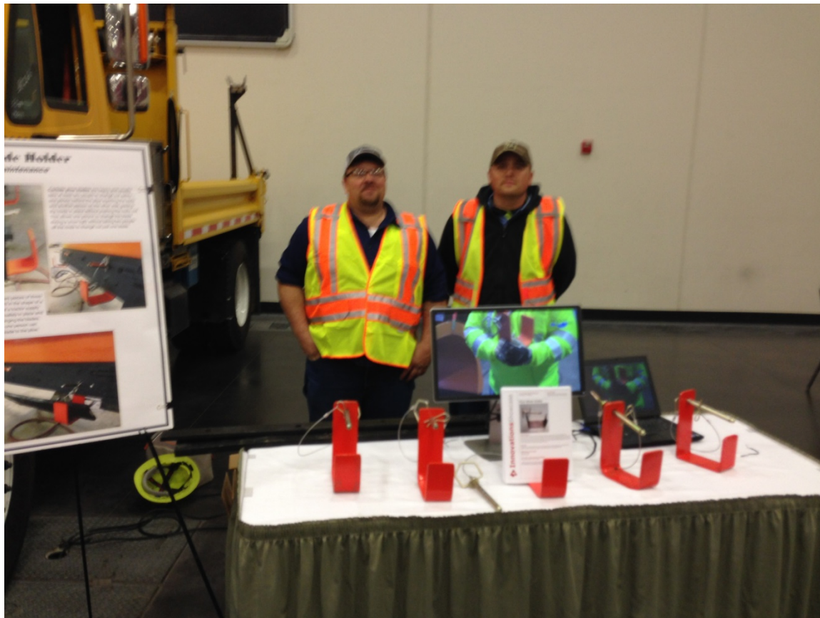
Plow Blade Holder