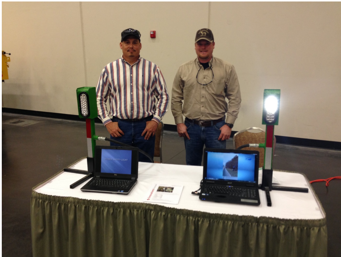
Bat Wing Strobe Light