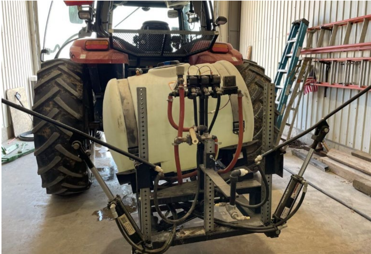
Adaptable Slope Tractor Sprayer – NE