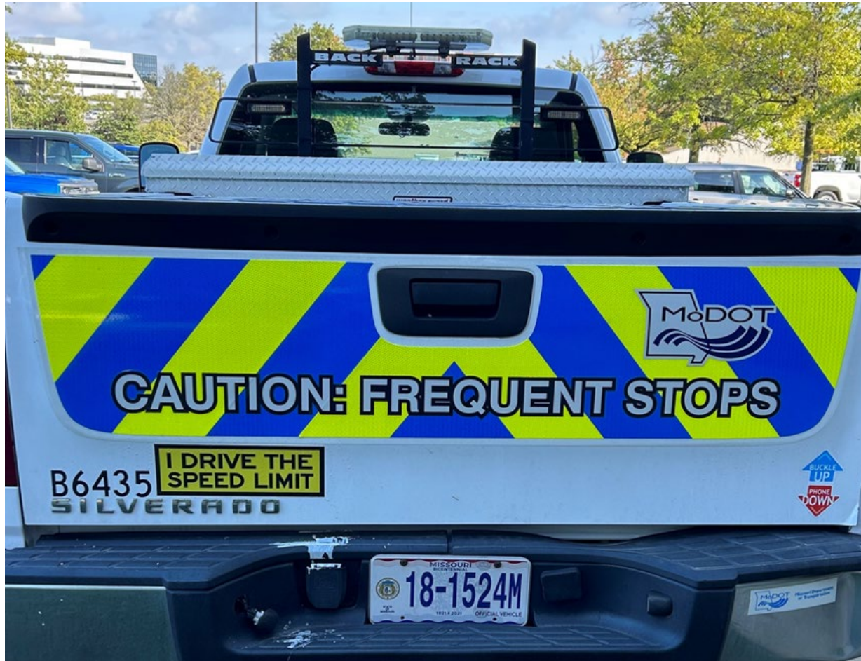
Tailgate Wrap – SL