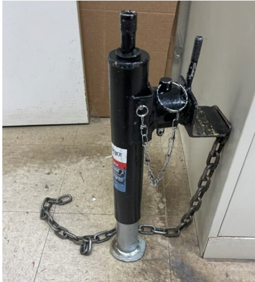
Snowplow Frame Jack – SE