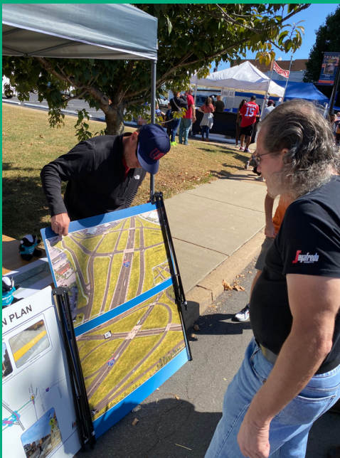
2022 Florissant Fall Festival