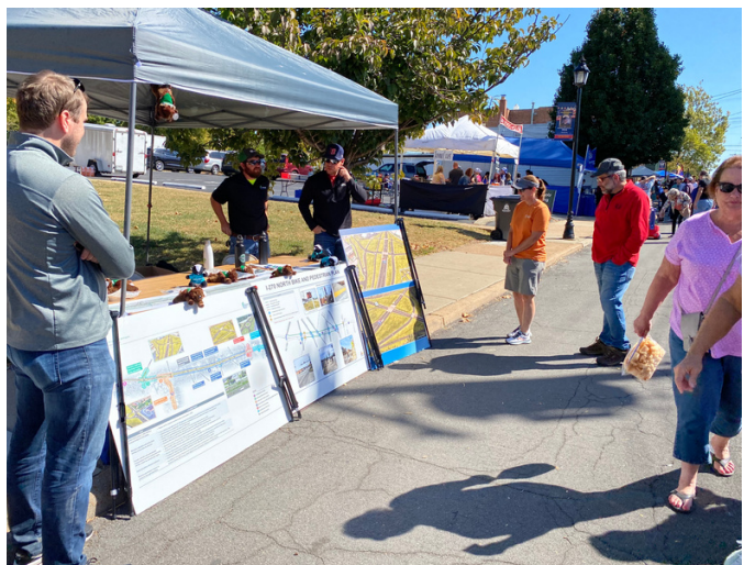
I-270 North Project team talk with public about the project at the Florissant Fall Festival.