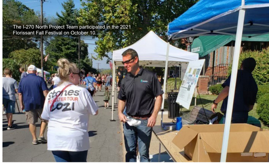
The I-270 North Project Team participated in the 2021 Florissant Fall Festival on October 10.