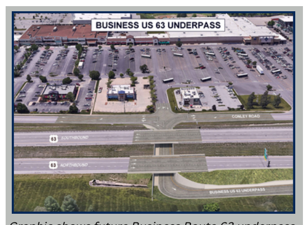
Graphic shows future Business Route 63 underpass.

Construction at the I-70 and U.S. Route 63 interchange is scheduled to begin in early October as part of <u>Improve I-70</u>: <u>Columbia to Kingdom City</u>. Crews will be working on Route 63 between I-70 and Broadway to build two new bridges to enhance the local connectivity in the area. Exact dates and times of this work will be announced soon.