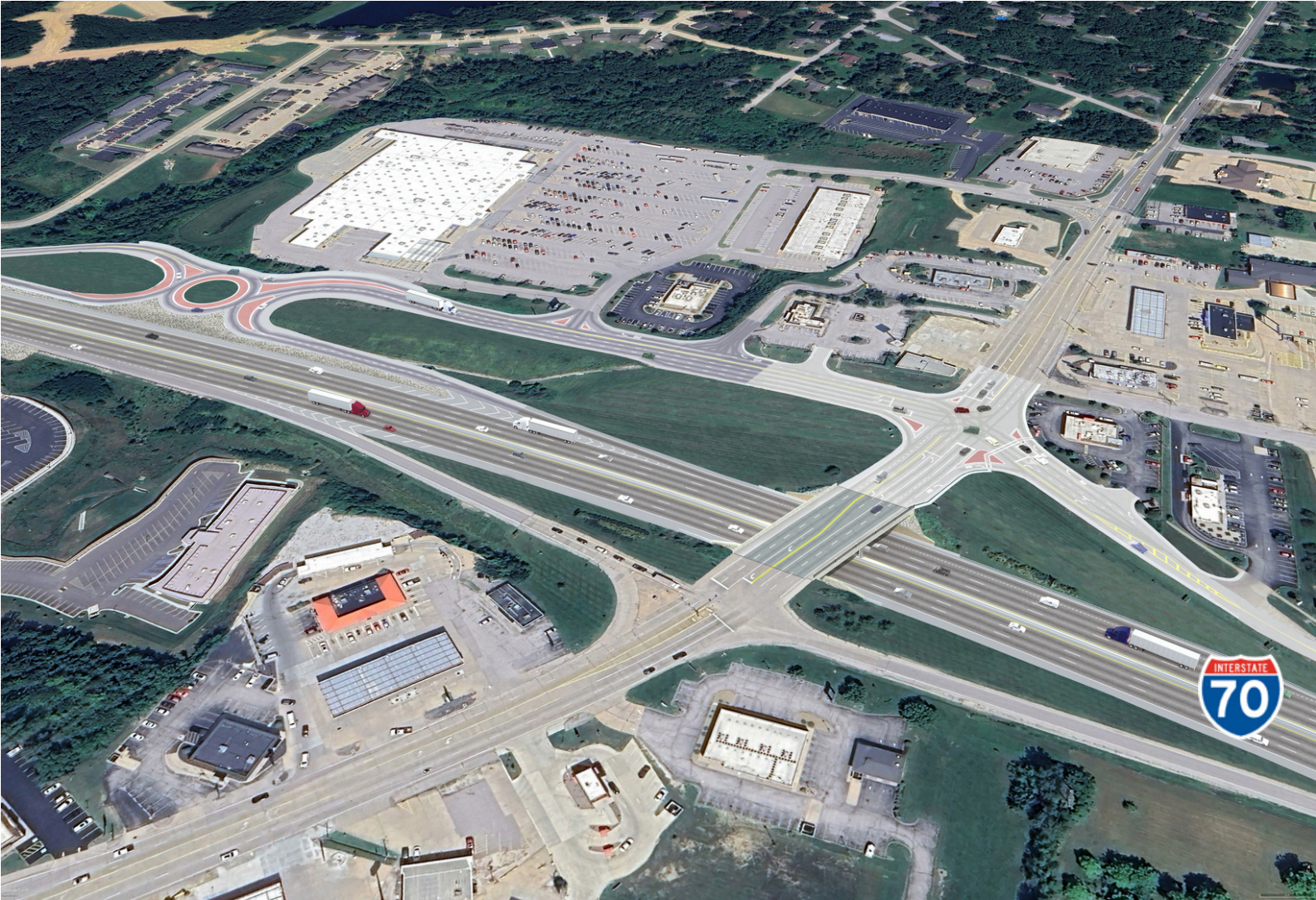
Proposed I-70 interchange in Warrenton at Route 47