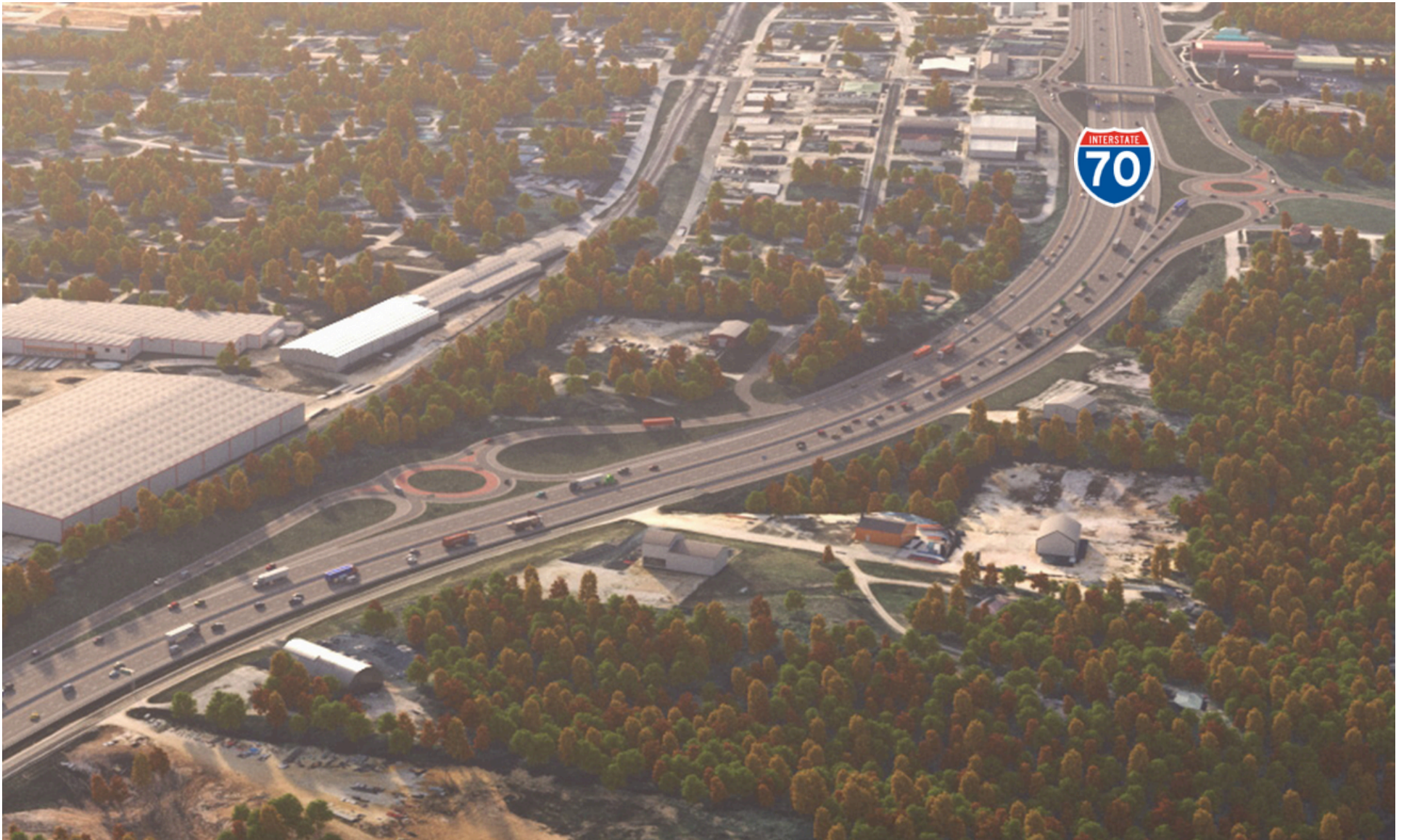
Proposed Wright City interchange (F/J/Elm) look west.