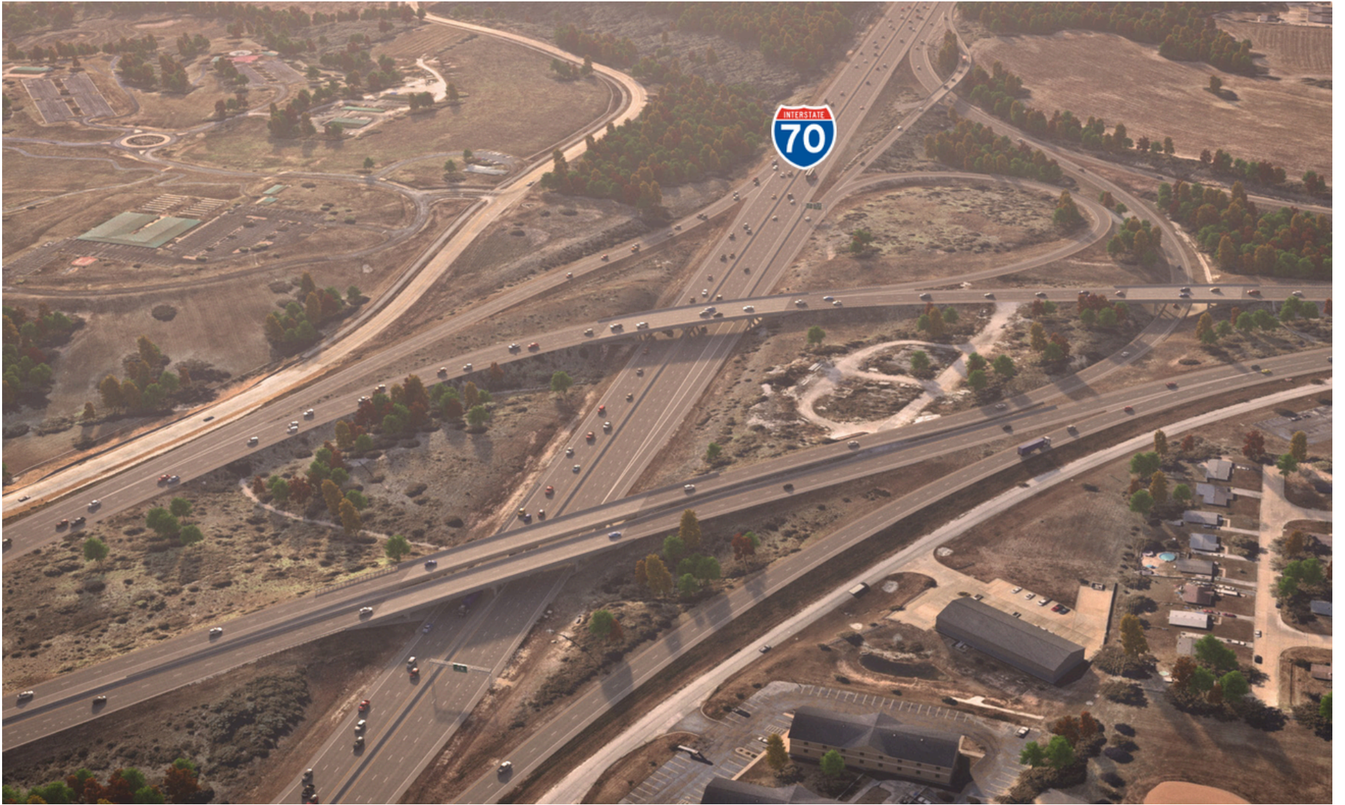
Proposed I-70 and I-64 / U.S. Route 61 Interchange looking west.