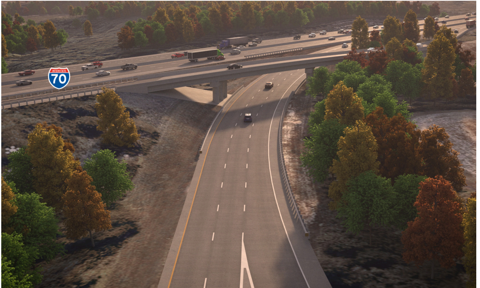
Proposed I-70 and I-64 / U.S. Route 61 Interchange looking south.