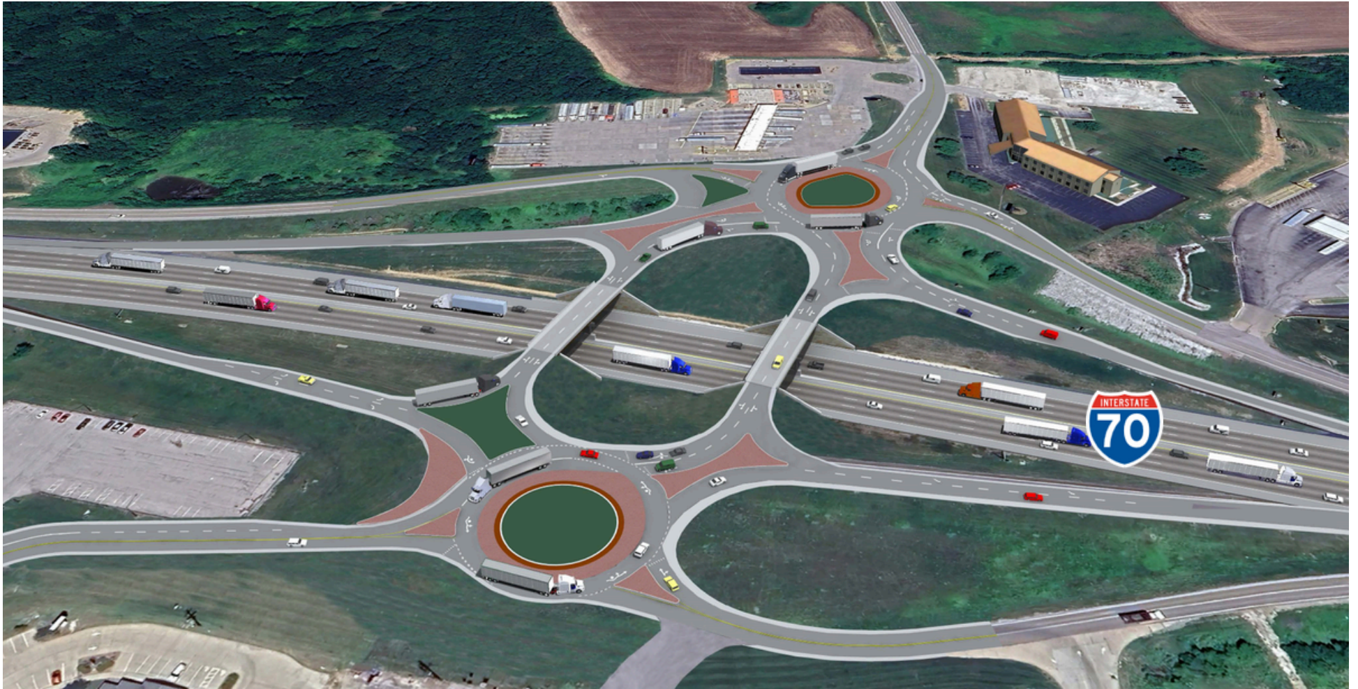
Proposed Foristell (T/W) Interchange looking north.