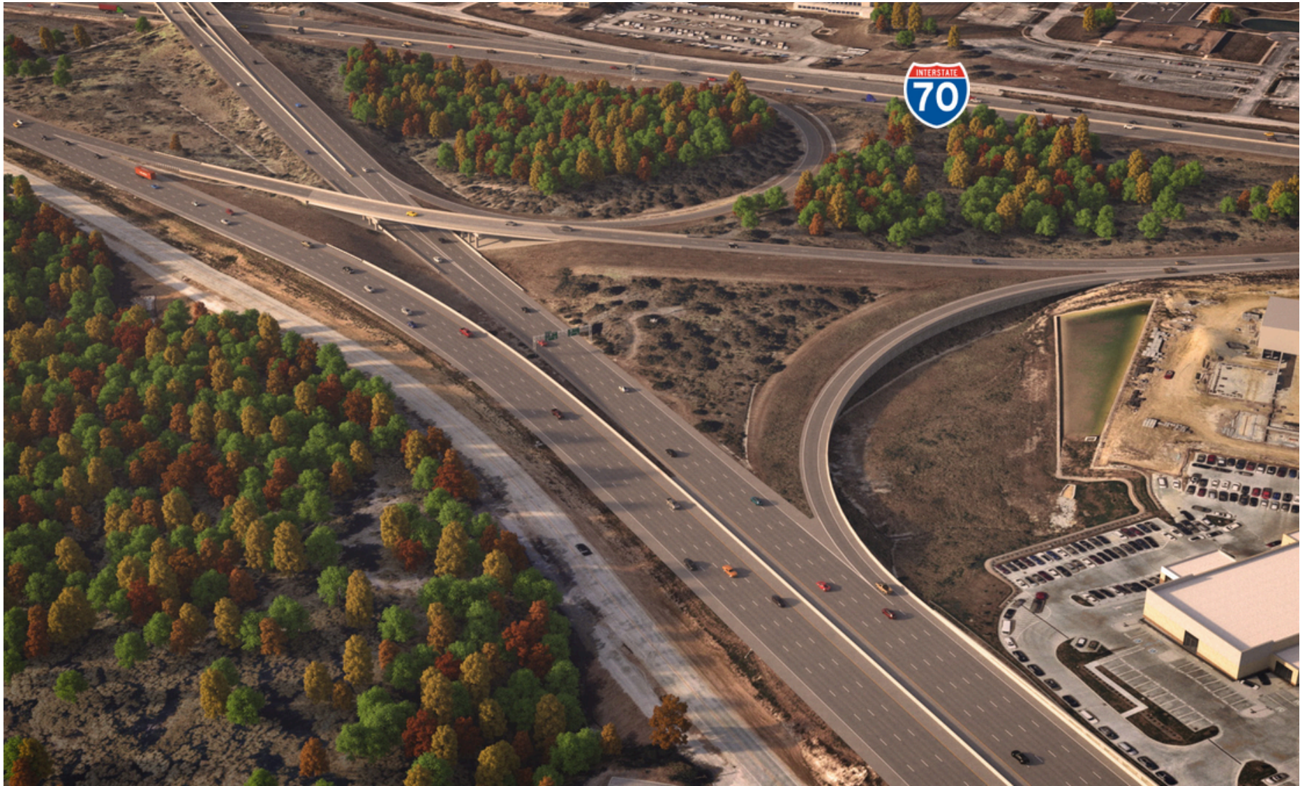
Proposed I-70 and I-64 / U.S. Route 61 Interchange looking north.