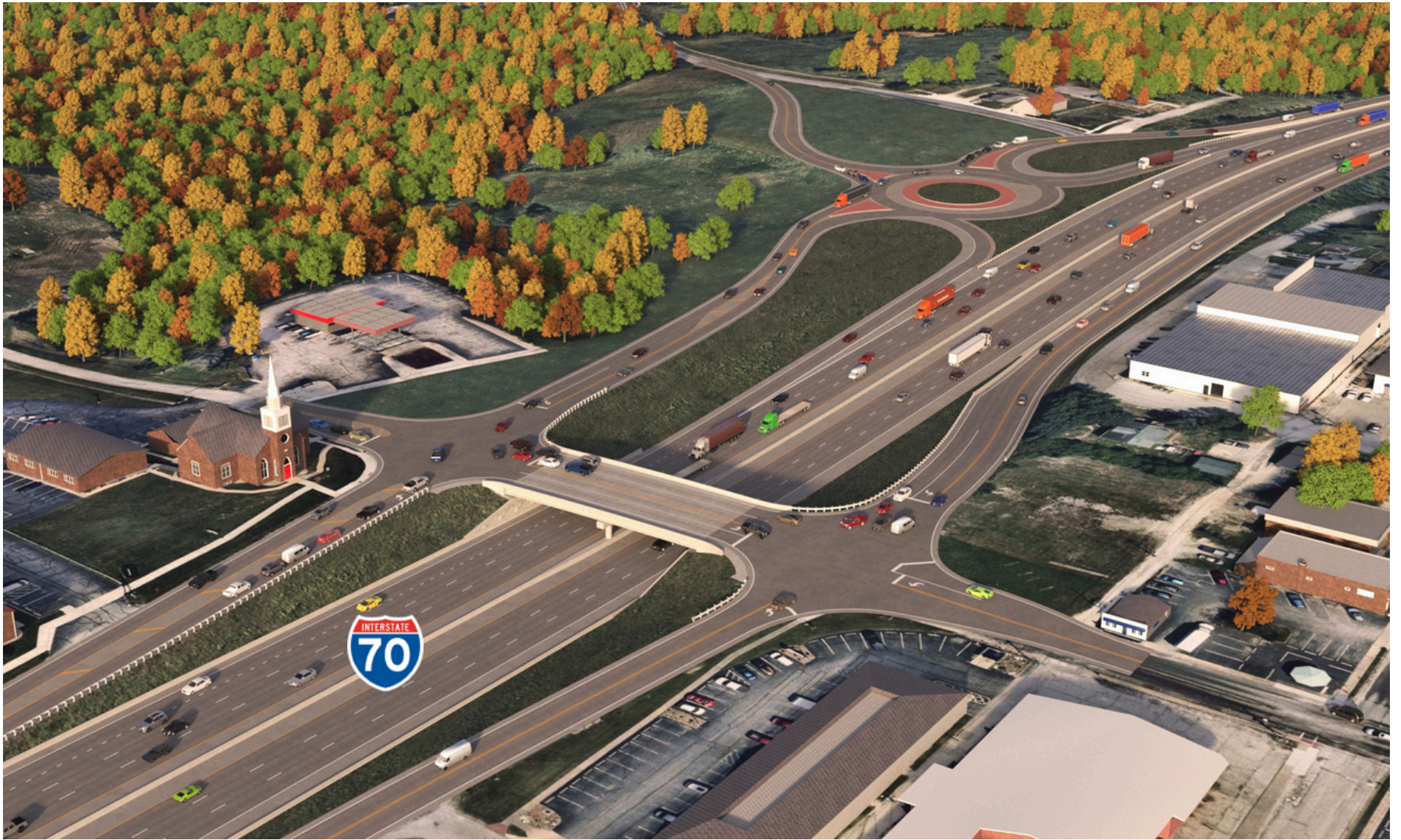
Proposed Wright City interchange (F/J/Elm) look east.