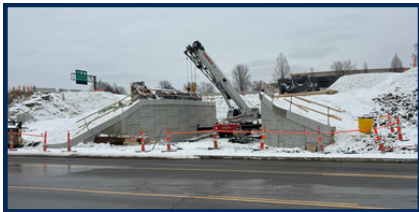
Barrier wall work and excavation for the new underpass on U.S. 63.

Construction of the Columbia to Kingdom City project is underway but extreme cold temperatures at night and a handful of snow events have slowed the overall progress. Crews are eagerly waiting for warmer temperatures so they can keep the project on schedule. Come spring and/or warmer weather, construction activities will continue with concrete paving overnight on eastbound I-70 between Callaway County Routes J and M, as well bridge work on southbound U.S. Route 63 for the construction of a new bridge/underpass. Learn more about upcoming construction plans at www.modot.org/improvei70/columbiakingdomcity .