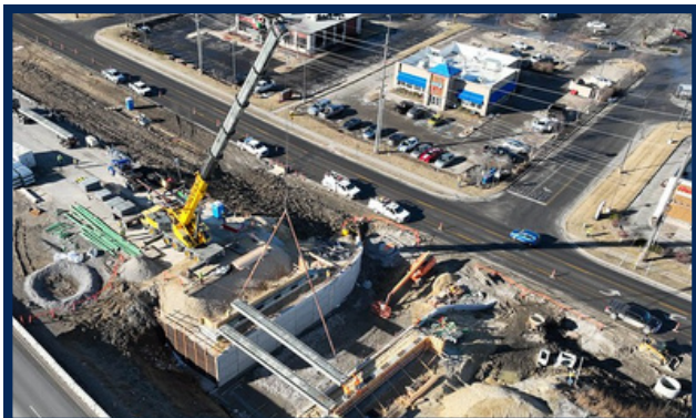
Crews placed the first bridge girders of the new southbound U.S. Route 63 bridge at Conley Rd. on Feb. 25.

Construction crews with Improve I-70: Columbia to Kingdom City placed the first bridge girders of the project in late February. The beams will eventually support the deck of the new bridge under construction on southbound U.S. Route 63 in Columbia. This southbound bridge, and its yet-to-be constructed northbound twin, will create an underpass at Route 63 and Conley Rd. allowing traffic from Conley Road to move north directly into the I-70/U.S. Route 63 interchange. This design also allows for better local connectivity on each side of Route 63.