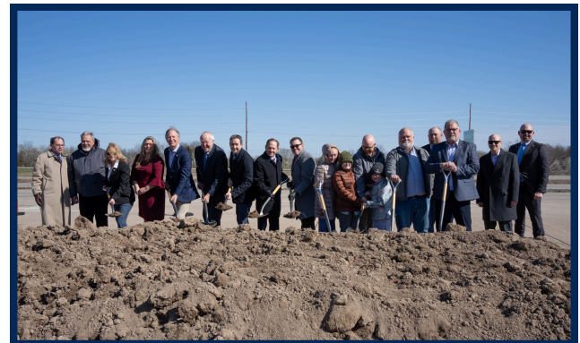
Numerous elected officials joined MoDOT and its Design-Build contractor team for the groundbreaking of Improve I-70: Warrenton to Wentzville on Thursday, March 20 in Foristell.

This project was awarded to the Design-Build contractor team, the Improve 70 Alliance (Emery Sapp and Sons, Clarkson Construction, HNTB, and Bartlett and West). Construction began this spring and completion is anticipated in late 2028.