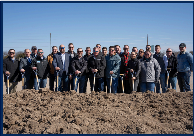
The Improve 70 Alliance joins MoDOT in an official groundbreaking for the Warrenton to Wentzville project. This team is a Joint Venture made up of contractors Emery Sapp & Sons and Clarkson Construction with designers HNTB and Bartlett and West.

The groundbreaking of the second project within the Missouri Department of Transportation's Improve I-70 Program kicked off with an official ceremony on March 20, in Foristell. MoDOT, joined by federal, state and local elected officials, along with members of the Missouri Highways and Transportation Commission and its contractor team gathered at the closed eastbound I-70 weigh station to break ground on Improve I-70: Warrenton to Wentzville .